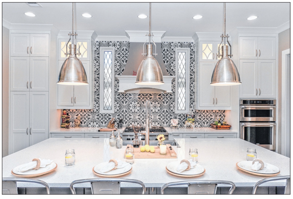
A space to eat

The Zimmermans' kitchen was designed with white cabinets, overhanging lights and a patterned backsplash.