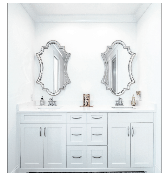
Shown is one of the bathrooms in the

Shown is a living room inside the Zimmerman residence in Chateau Elan. The family built a "modern farmhouse" in the Braselton community.